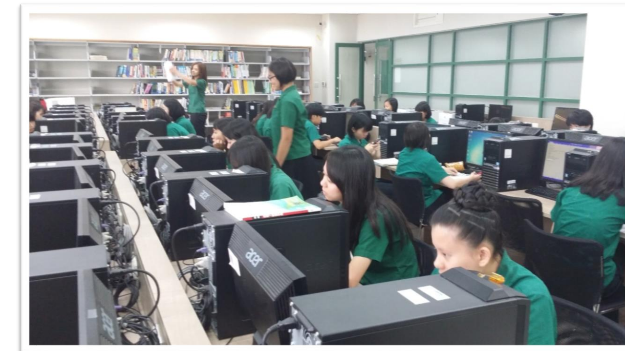
Figure 1. Students in programming class.